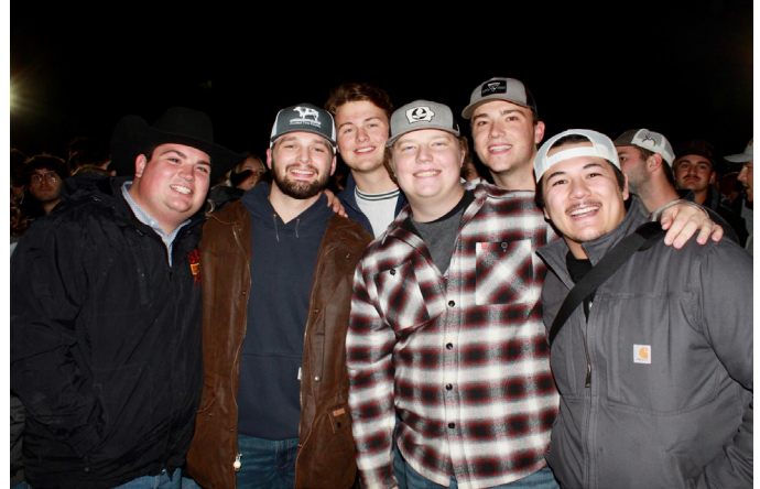
Brothers Enjoying the Lawn Display Performance